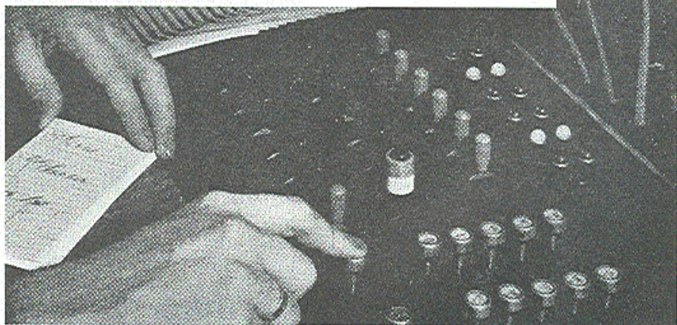
Above is the Bell System's new "musical keyboard." Insert shows the digits of telephone numbers in musical notation, just as they are sent across country.